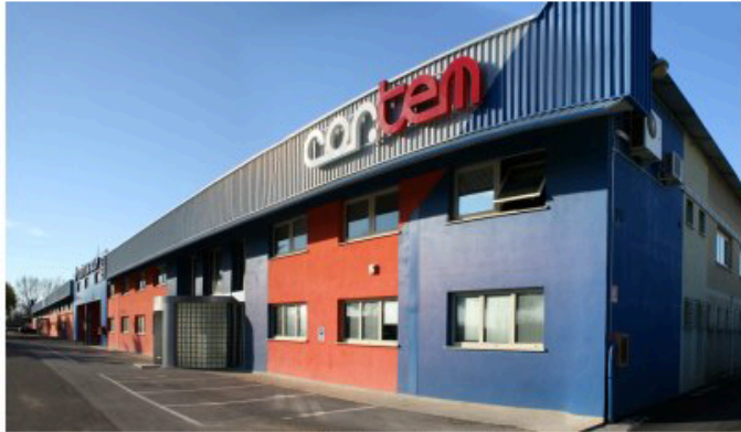
Cortem's headquarters today

'Think globally, act locally' has always been a core concept for the Group, and this has underpinned its dynamic expansion around the world, with both commercial activities and product assembly devolved to branches abroad.